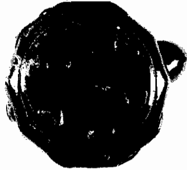
Base of Meyer "Rebekah at the Well" teapot marked FIREPROOF. Note pads designed to disperse heat and prevent cracking.