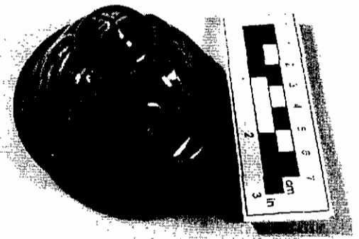
Rebekah at the Well teapot lid recovered from the Arsenal pottery dump.