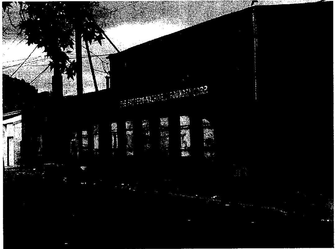
Plate 1. View looking northwest showing the Arsenal Pottery decorating buildings on Schenck Street.