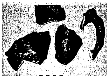
Figure 3: Remains of a pitcher with a hunting motif.