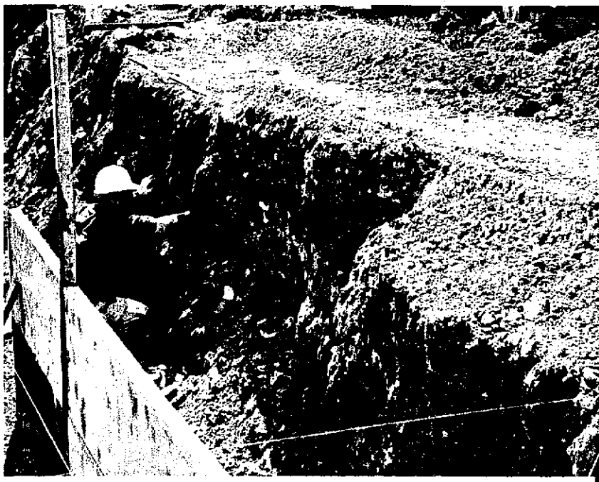
Figure 1: Author William Liebeknecht examines the yellow ware waster deposit in the side of a construction trench.