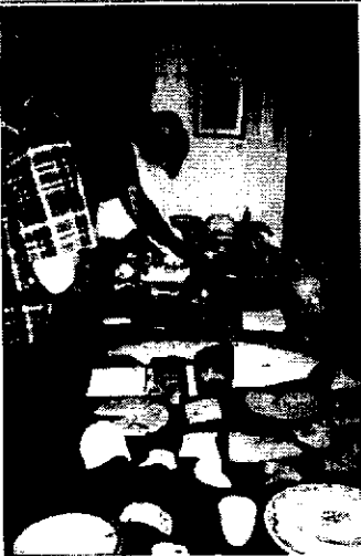
Visitors examine the display of ceramic artifacts recovered during archaeological excavation in Trenton.